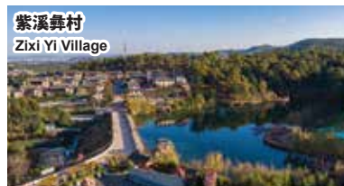
紫溪彝村 Zixi Yi Village