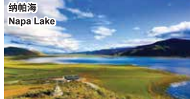
纳帕海 Napa Lake