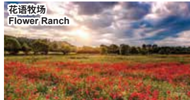
花语牧场 Flower Ranch