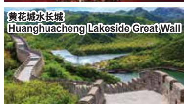
黄花城水长城 Huanghuacheng Lakeside Great Wall