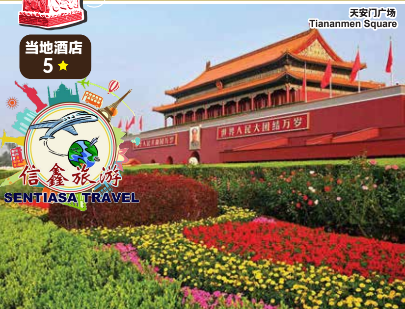
天安门广场 Tiananmen Square