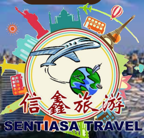
鸟巢 Beijing National Stadium